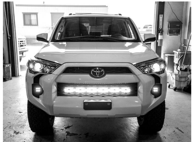
Finished install with Hidden 30" Bumper Bracket